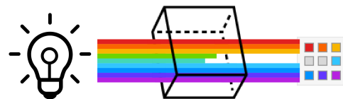
Figure 1: Optical Spectroscopy

Optical spectroscopy is the interaction between optical photons and matter [10]. Given a lightsource, a medium, and a set of photodetectors, as shown in Figure 1, we can measure the optical response of the medium. When photons are absorbed by the medium, there will be fewer photons measured by the photodetectors. When photons pass through or excite the medium, there will be more photons measured by the photodetector. To create a wearable optical spectrometer, there are two choices: reflection and transmission. Reflection is commercially available in devices like smartwatches, while transmission appears in devices such as fingertip pulse oximeters. As an early prototype, we decided to focus on transmission sensors to reduce parameter consideration, such as angle of the source, and literature supports the decision for transmission measurements [3]. Thus, we use transmission fingertip spectroscopy in a similar design to a pulse oximeter.